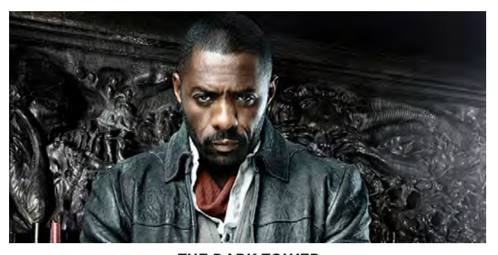
THE DARK TOWER In Theaters August 4

STEP is the true-life story of a girls' high-school step team set against the background of the heart of Baltimore. These young women learn to laugh, love and thrive - on and off the stage even when the world seems to work against them. Empowered by their teachers, teammates, counselors, coaches and families, they chase their ultimate dreams: to win a step championship and to be accepted into college.