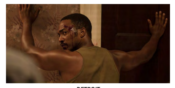
DETROIT In Theaters August 4

Idris Elba stars as Roland Deschain, the last Gunslinger, is locked in an eternal battle with Walter O'Dim, also known as the Man in Black. The Gunslinger must prevent the Man in Black from toppling the Dark Tower, the key that holds the universe together. With the fate of worlds at stake, two men collide in the ultimate battle between good and evil.